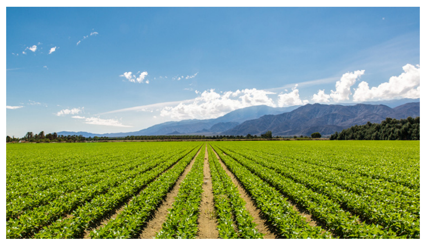
On 25 January 2017, the ATO released Taxation Determination 2017/1 regarding the taxation treatment of intangible capital improvements that are affixed or made to pre-CGT assets. The ATO has provided an example of the type of taxpayer that this determination is targeting: